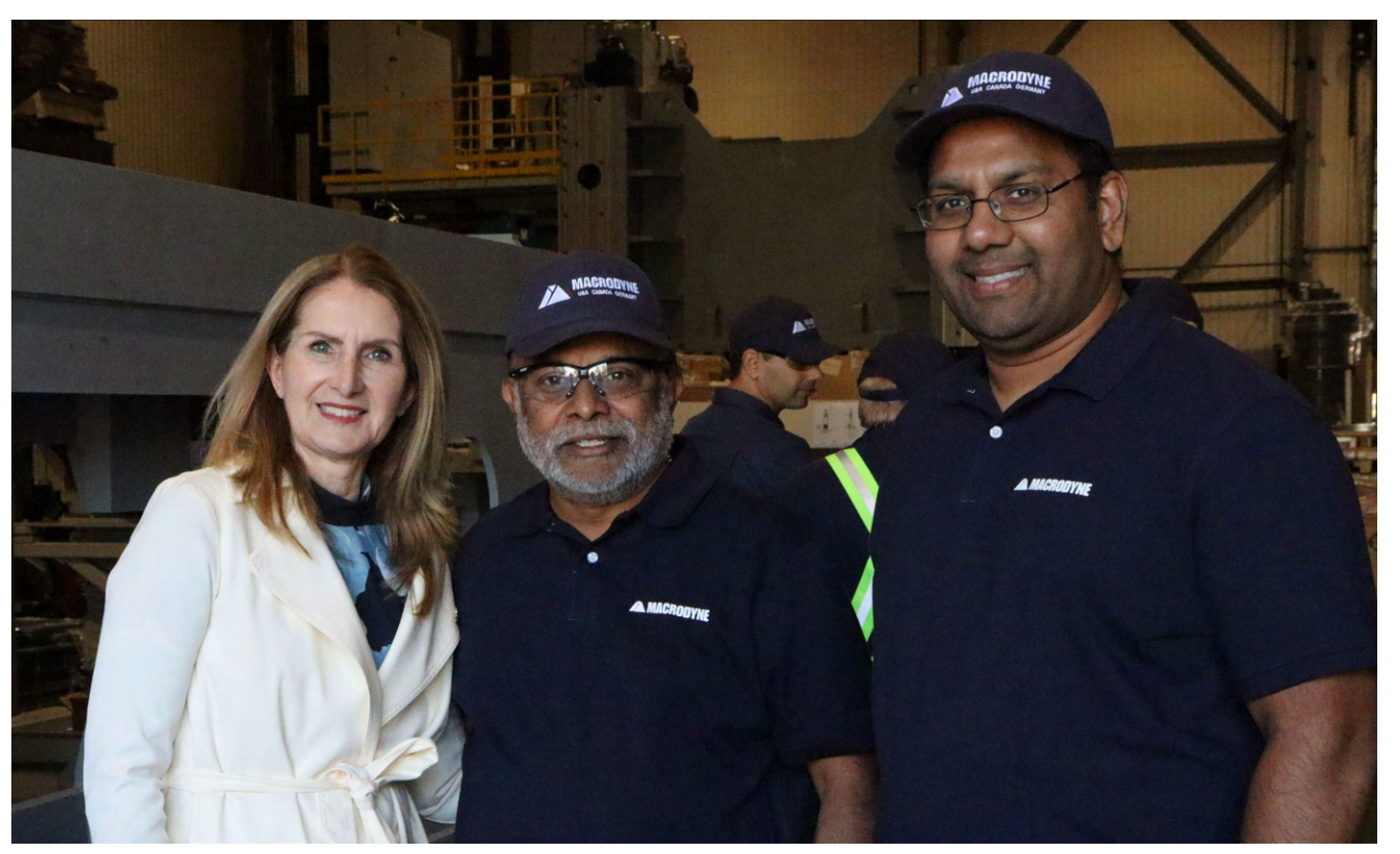
Thornhill is a hub of innovation. I am proud of our government for investing in Ontario Made manufacturing, and helping our local manufacturers lower costs, invest in workers, innovate and become more competitive.

I am looking forward to seeing Macrodyne Hydraulic Presses & Automation grow and expand their operations and bring more people and jobs to our community.