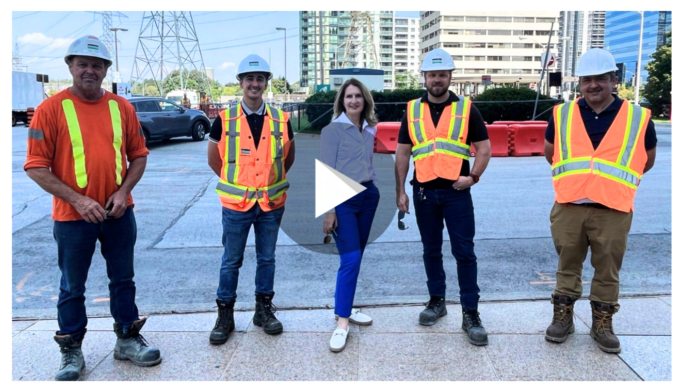
Watch our newest update on the construction of the Yonge North Subway Extension