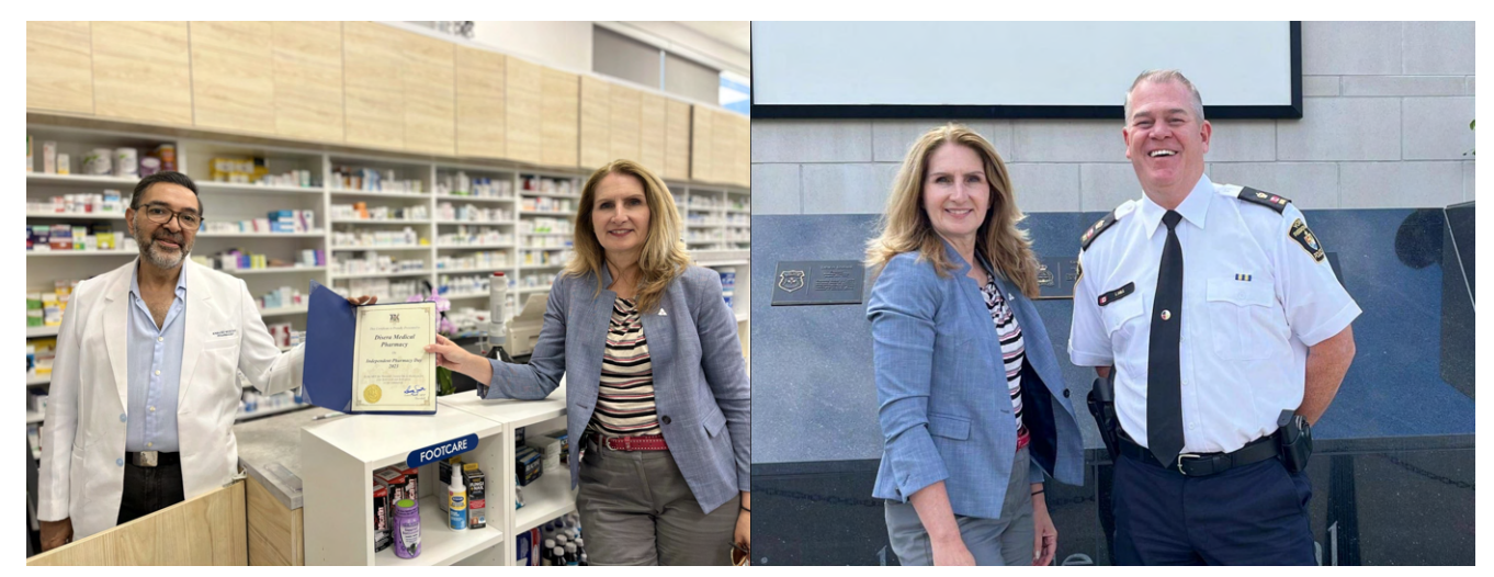
Celebrating Independent Pharmacy Day -Special thanks to the Disera Medical Pharmacy for their hard work and dedication, they've got a great team of staff that's there to help!