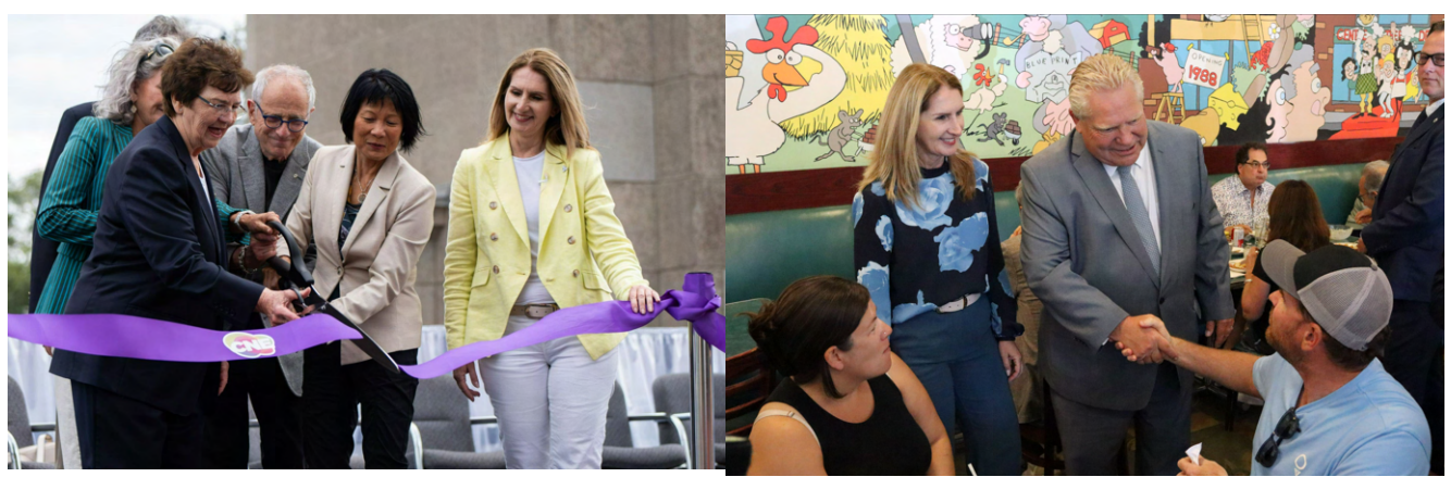
Summer in Toronto isn't complete without a trip to the Ex!

Did you know: The CNE attracted more than a million and a half visitors last year? The Ontario government is proud to provide funding to the Canadian National Exhibition Association.