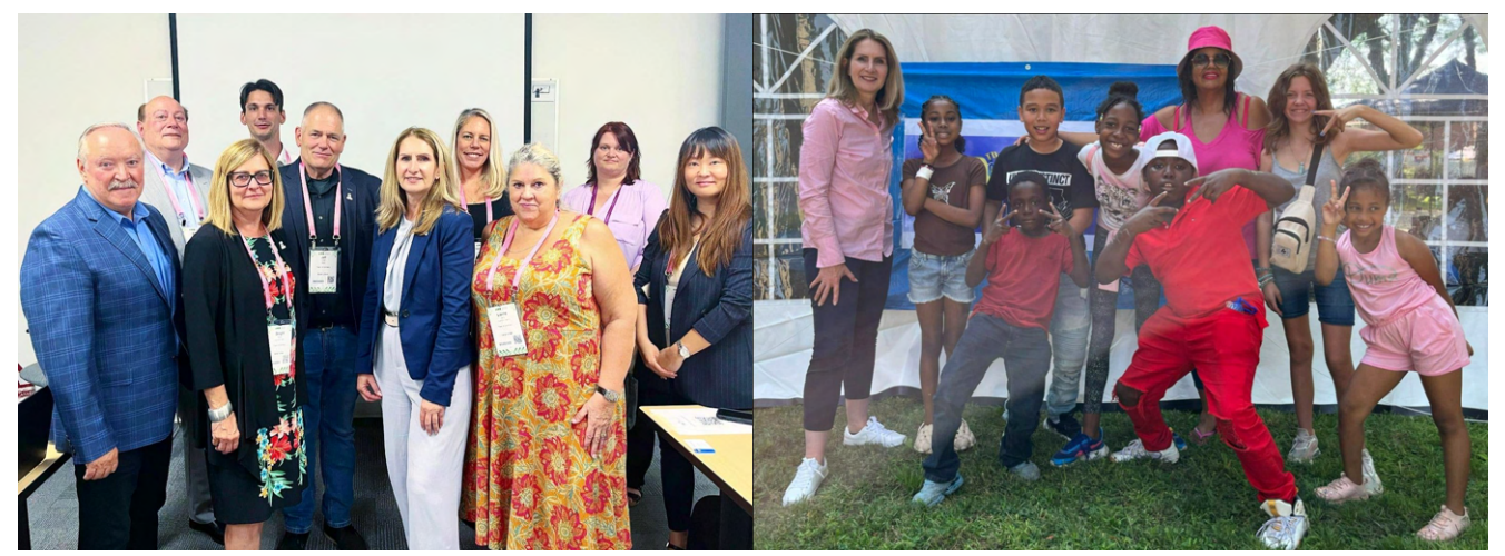
Productive time at the annual Association of Municipalities of Ontario (AMO) Conference in London - it was great to sit with municipal leaders from all across the province to discuss their top priorities.